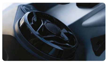
BRP Audio - premium system

USB port, watercraft cover, storage bin organizer, knee pads, exclusive coloration and more