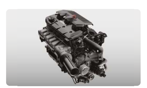
ROTAX® 1630 ACE™ - 325 ENGINE

An innovative, industry-first system that allows you to free your pump of weeds and debris with intuitive handlebar-activated controls.