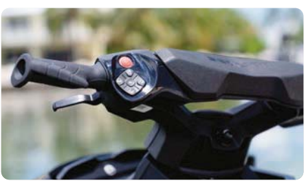
iDF - Intelligent Debris Free system

A factory-installed, truly waterproof Bluetooth<sup>‡</sup> audio system for an extra dose of fun and entertainment on the water.