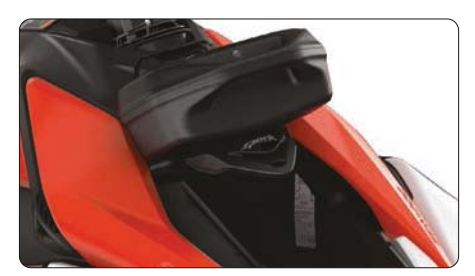
BRP Audio - Portable System (optional)

The Rotax® 900 ACE™ - 90 gives crisp acceleration with impressive fuel economy.