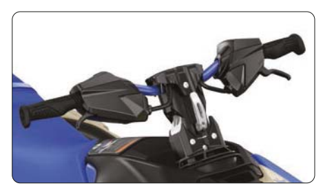
iBR® (Intelligent Brake & Reverse)

The BRP audio-portable system provides higher quality sound on and off the water featuring Concert, Ride and Home mode. Equiped with a heavy duty mounting bracket.