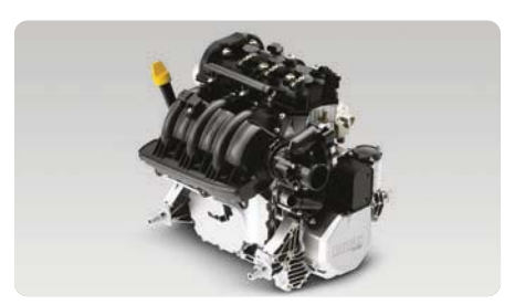
ROTAX® 900 ACE™- 90

A telescopic steering system that optimizes the experience for varying rider sizes.